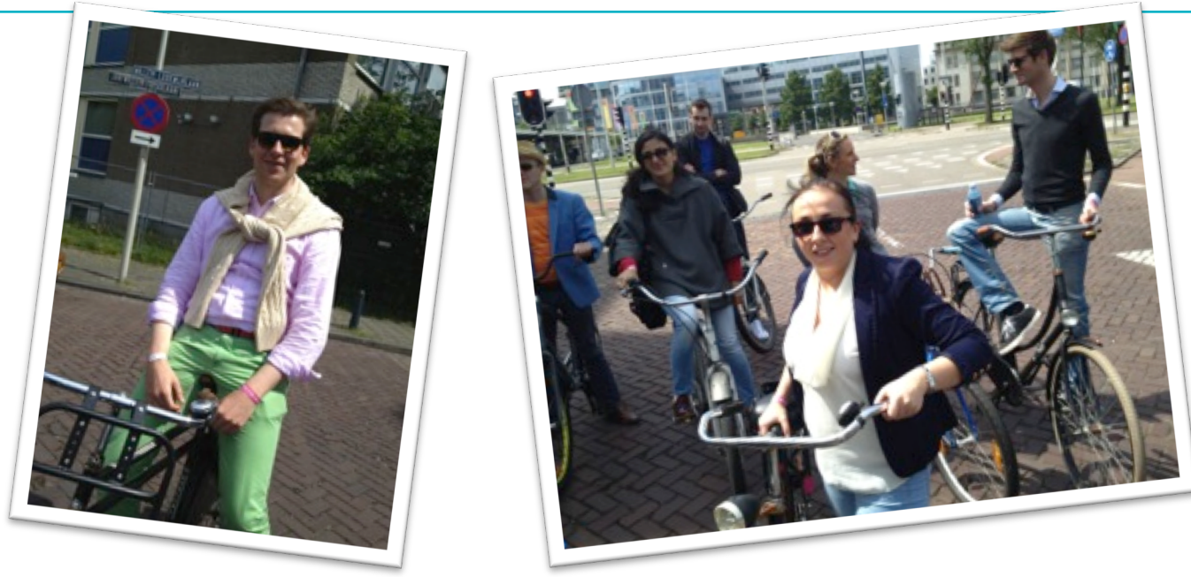
The President and the Immediate Past President enjoy a cycling tour of The Hague during the Summer Conference in June 2013